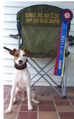
Hopewell Acres Trouble