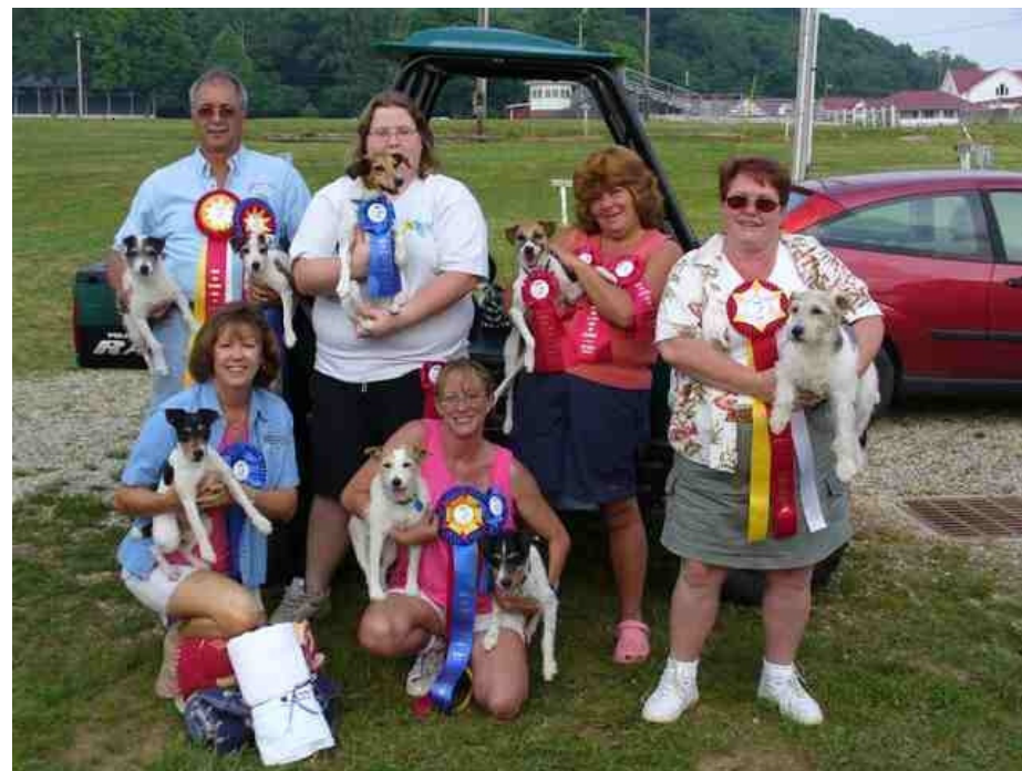
Buckeye State JRT Club, Lancaster, Ohio May 26-27, 2007.