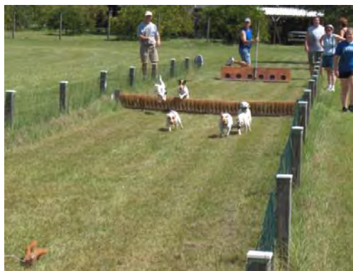
A typical SSJRTC Free practice day.

The Sunshine State Jack Russell Terrier Club (SSJRTC) is currently the only JRTCA affiliated club located in Florida. The primary mission of the SSJRTC is to educate people about Jack Russell Terriers, to be a group that has fun with our terriers, and to preserve and work our terriers. Also, to protect, maintain and promote (for educational purposes) the acceptable breed standard of the Jack Russell Terrier. SSJRTC membership includes the Terrier Times, SSJRTC's E-newsletter; discount entry fees at non & sanctioned SSJRTC events, SSJRTC voting privileges, and free practice/training sessions of performance trial events.